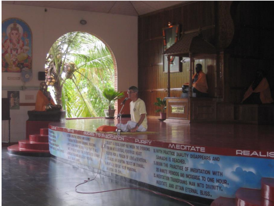
A staff member gives an afternoon lecture to ashram guests from the stage in the main hall at the SYVC ashram in Neyyar Dam, Kerala, March 2011.