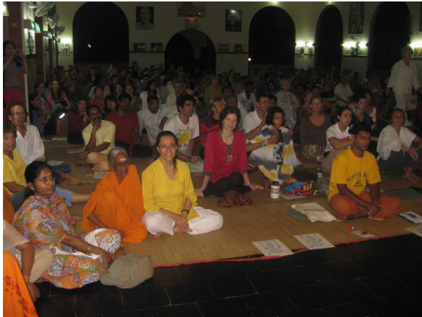
Students and ashram guests in the audience for the inauguration of an international Teachers Training Course at the SYVC ashram in Neyyar Dam, Kerala, in November 2010. SYVC courses and programs typically present lectures and discourses from a stage at the front of a long hall, with student participants seated in rows on the floor below, as shown here.