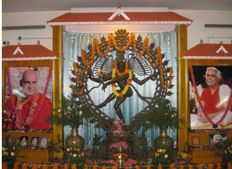
The main altar at the urban SYVC center in Trivandrum, the capital of Kerala in South India, is shown here, decorated for the first anniversary celebration of the center's new building, on February 20 th , 2010. The sculpture in the center embodies the dancing figure of the god Siva, known as Nataraj, and the large photographs on the left and right of the picture show the organization's gurus, Swami Sivananda and Swami Vishnudevananda. The flower offerings, lamps, and the images themselves all identify SYVC practice with Hindu Indian traditions.