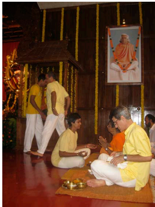
An initiation ceremony at the start of a Teachers Training Course at the SYVC’s Kerala ashram in November 2010 involved both Western and Indian teaching staff in the initiation of course participants. Staff applied consecrated powders to the foreheads of course initiates to sanctify their study and initiate them into the gurukula lineage under SYVC founder Swami Vishnudevananda, whose image hangs on the wall above.