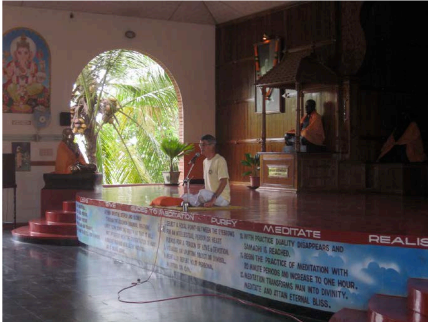
A staff member gives an afternoon lecture to ashram guests from the stage in the main hall at the SYVC ashram in Neyyar Dam, Kerala, March 2011.