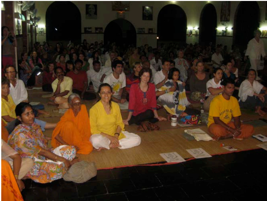
Students and ashram guests in the audience for the inauguration of an international Teachers Training Course at the SYVC ashram in Neyyar Dam, Kerala, in November 2010. SYVC courses and programs typically present lectures and discourses from a stage at the front of a long hall, with student participants seated in rows on the floor below, as shown here.